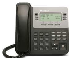
Edge 9000 Series IP Phones