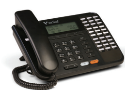
Edge 9000 Series Digital Phones

Users can get the most out of the Summit's feature set with a variety of Vertical phones, including the new Edge 9000 Series IP and digital phones and DECT phones featuring display-based interfaces, call logs, self-labeling keys and simplified administration.