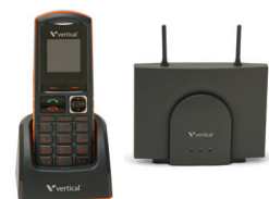
Summit Wireless DECT System

For additional information on the Vertical Summit and Summit 800, including pricing, technical documentation and marketing collateral, see the Summit product page on V-Connect, or contact Mario Hernandez, mhernandez@vertical.com , 480-374-8828.